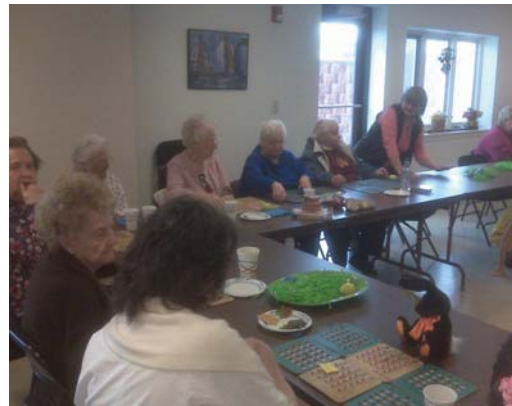
Bingo at Luther House

Thank you for all of the wonderful donations for our Bingo Tea Party at Luther House on March 27. Both the food and prizes were enjoyed by all. Those who volunteered to help out at this event were truly blessed in seeing the joy you helped to provide. Thank you for sharing the abundance of God's love with others!